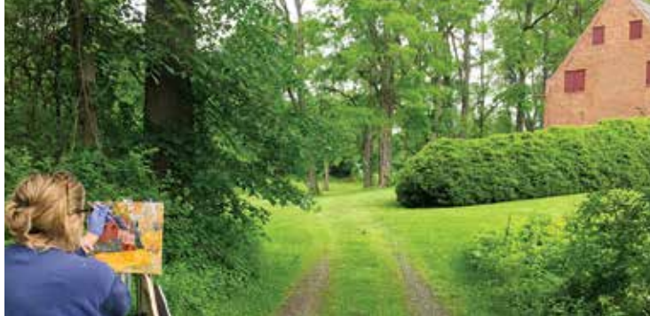
Plein Air at 1737 Luykas Van Alen House