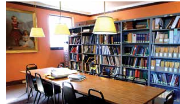
Barbara P. Rielly Memorial Research Library, CCHS

During the past 18 months our research library has been busy fulfilling a record number of research requests. We are now accepting in-person appointments at CCHS' Library. Please visit www.CCHSNY.ORG/visit to book your visit.